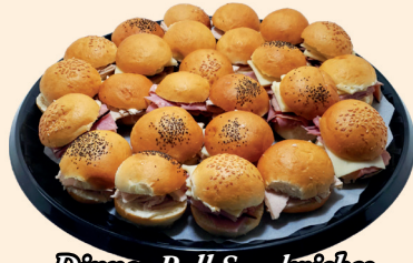
Dinner Roll Sandwiches

Your choice of assorted meats with mayo. Include lettuce/tomato per request. $60.00 per dozen